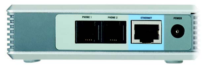
Figure 2-1: Back Panel

The Phone Adapter's ports are located on the back panel.