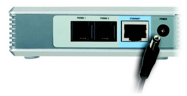
Figure 3-4: Connect the Power