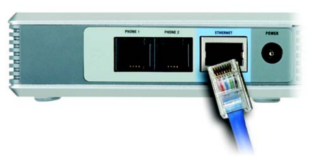
Figure 3-3: Connect the Ethernet Network Cable

Proceed to the next section, "Placement Options," if you want to attach the Phone Adapter's base.