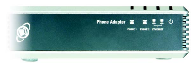
Figure 2-2: Front Panel

The Phone Adapter's LEDs are located on the front panel.