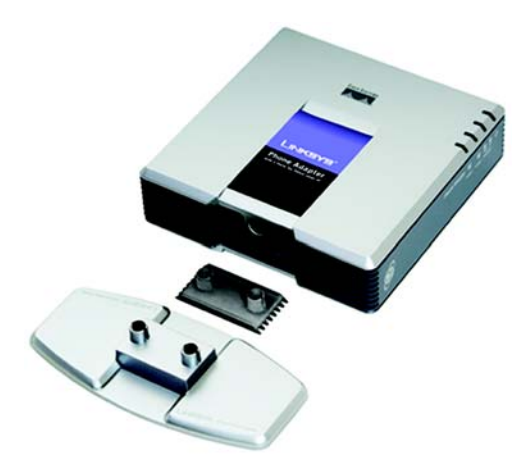
Figure 3-5: Attaching the Phone Adapter's Base

If you need to change any of the Phone Adapter's network settings, proceed to "Chapter 4: Using the Phone Adapter's Interactive Voice Response Menu."