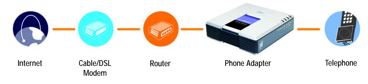
Figure 3-1: Connect the Phone Adapter to Your Network and Telephone

This chapter gives instructions on how to connect the Phone Adapter to your network and telephones or fax machines. Shown below is a connection diagram displaying a typical setup.