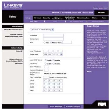
Obtain an IP Automatically

a If your ISP says that you are connecting through